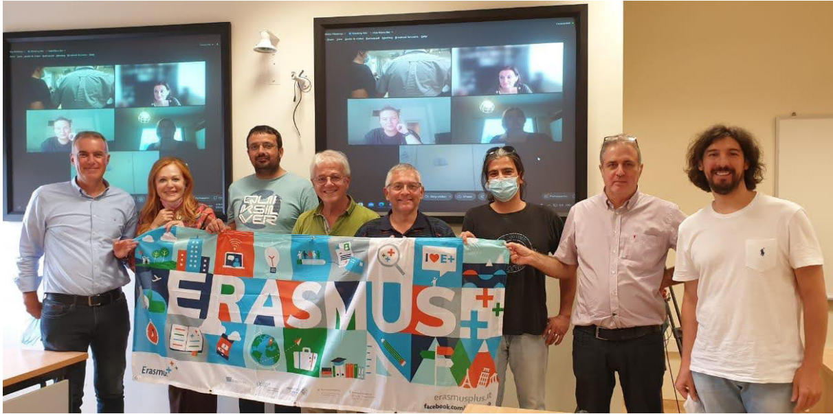
SSE project partners during the meeting in Athens.